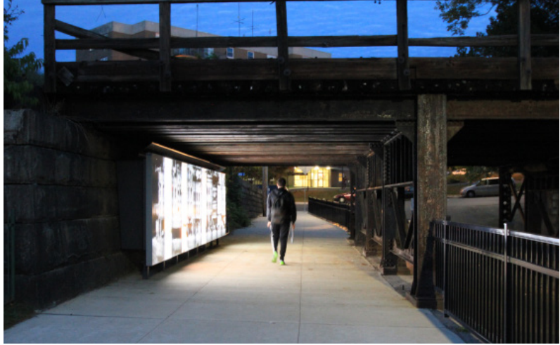
VIEW OF "ARRIVALS" INSTALLED IN THE MOSHER STREET UNDERPASS